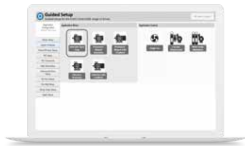
Guided setup screen within the Connect PC software

Gain complete control of your drive with Control Techniques' Connect PC Software. The dynamic drive logic diagrams allow the visualisation and control of the drive in real time. The parameter browser enables viewing, editing and saving of parameters as well as importing parameter files.